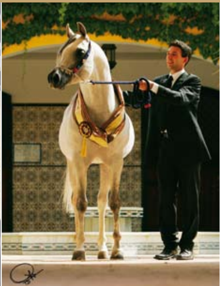
FT Shaella Gold Medal Fillies World Championship Paris 2010